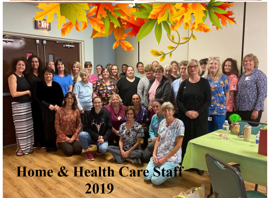
Home & Health Care Staff 2019